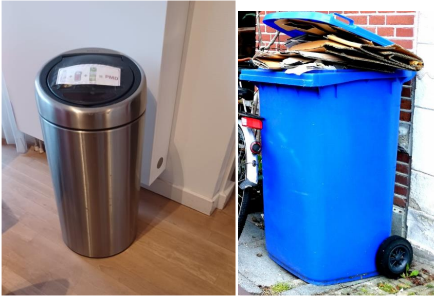
Left: big waste bin (approx. 60L) for PMD. Right: waste container for paper (approx. 240 L?)