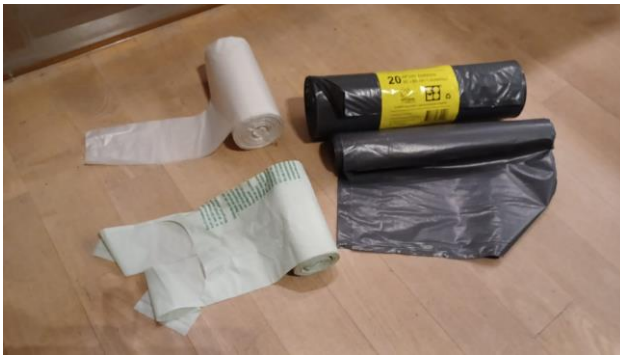
Waste bin bags (left bottom and top: 20L, right 60L).