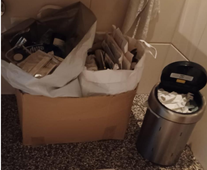
Left to right: PMD, paper, general waste.