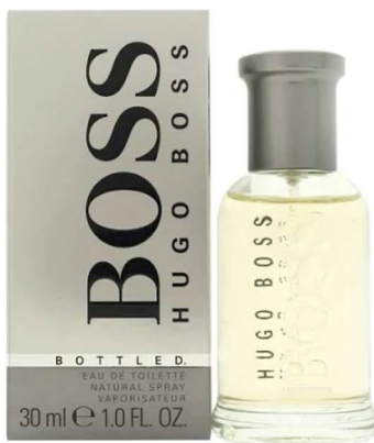
Hugo Boss Bottled Eau de Toilette 30 ml | Boss