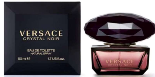
Versace - Crystal Noir Eau de Toilette 50 ml